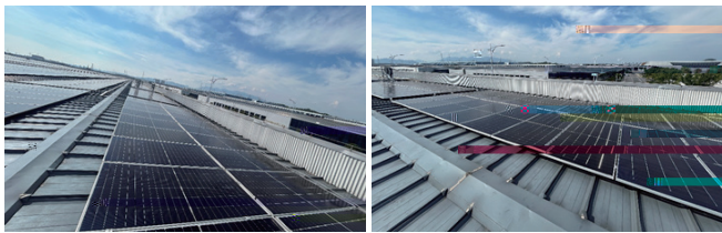
: Project Picture

BC modules are assumed to be ideal for rooftop installation because of their higher front-side power relative to TOPCon module. Meanwhile, the bifaciality disadvantage of BC cells can be minimized in rooftop scenarios. Therefore, this study compared the performance of TOPCon PV modules and BC modules to determine their energy yield in real-world conditions and their potential for rooftop applications.